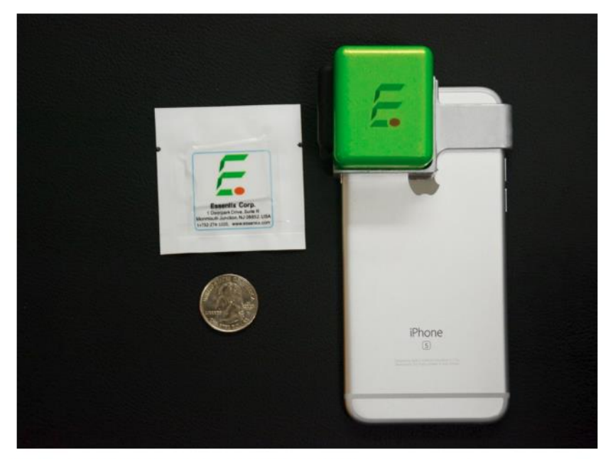
Essenlix's blood-testing device attached to an iPhone.